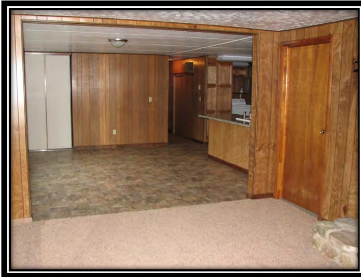
Fireplace in Living Room