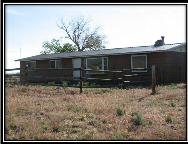
Front View of Home