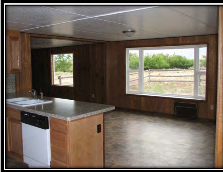
Kitchen/Open Living Area