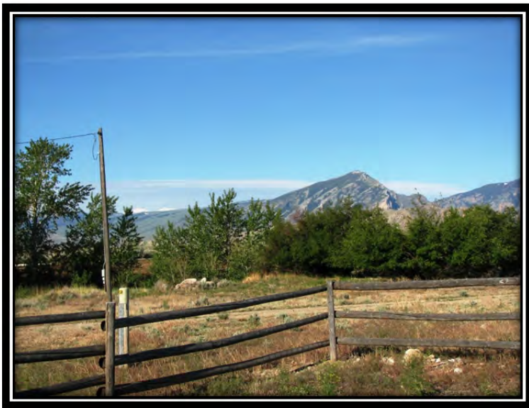
Clarks Fork Canyon